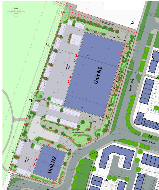
INDICATIVE SITE PLAN - NORTH PLOT

PLEASE SEE OVERLEAF FOR INDICATIVE SITE PLANS