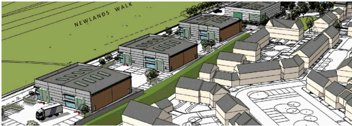
NORTH WEST AERIAL VIEW OF SOUTH PLOT