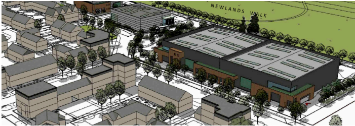
SOUTH WEST AERIAL VIEW OF NORTH PLOT

The site forms part of the "West of Waterlooville" Major Development Area and lies within the land originally designated for employment uses (Class E, B2 & B8) in the Design Code for the original Outline Planning Permission for Wellington Park (ref. 05/00500/OUT).