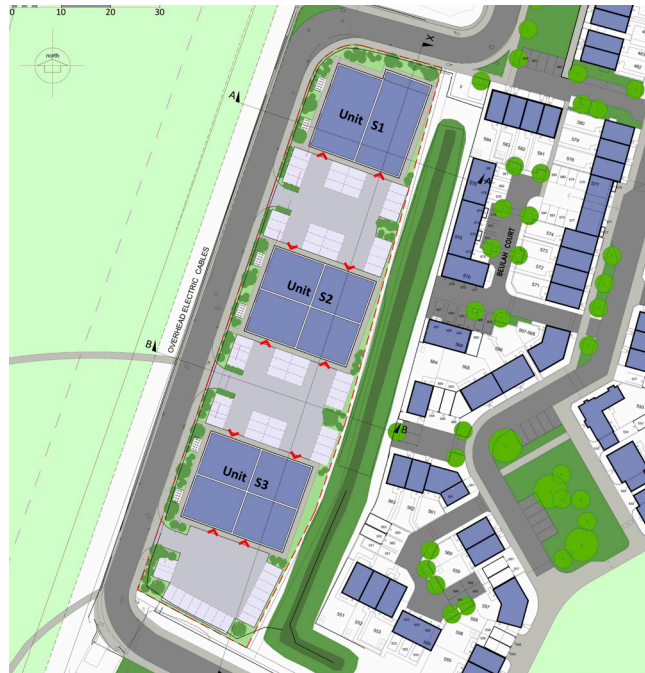
INDICATIVE SITE PLAN - SOUTH PLOT